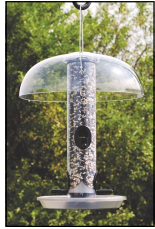
Place Feeders Near Cover

For winter, birds will change the kinds of foods they eat. Instead of insects and fruits, birds eat more seeds and nuts. Often, the food birds eat in the day help build up fat reserves that are used throughout the night to keep warm. Offer suet, Bark Butter, Bird Food Cylinders and blends with nuts to help birds maintain their high metabolic rate and stay warm.