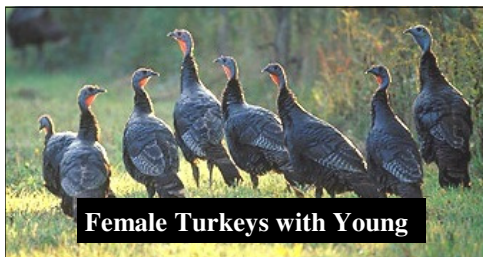
Female Turkeys with Young

Pick up your FREE WBU 2015 bird calendar the next time you stop in. Available while supplies last. One free per family. Extras are $2.00 each.