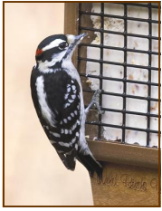
Attract Birds with Fatty Foods