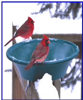
Water Helps Birds Maintain Their Feathers

Use a heated bird bath or add a heater to your existing plastic, metal or stone bird bath. This will help make some water available even on the coldest days and attract birds that may not visit feeders very often.