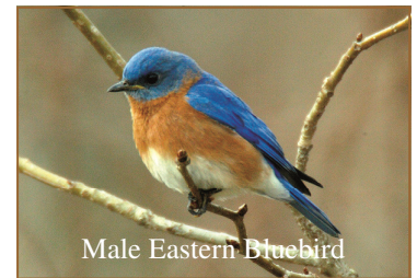
Male Eastern Bluebird