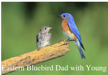
Eastern Bluebird Dad with Young