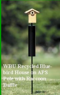
WBU Recycled Bluebird House on APS Pole with Raccoon Baffle