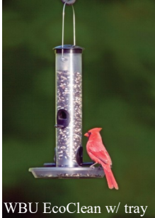
WBU EcoClean w/ tray

As Fall comes around and Winter prepares to roll in there are several ways you can prepare your yard to help your birds during the coldest time of the year in Wisconsin.