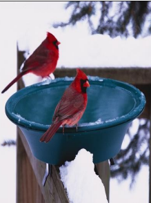
WBU Heated Bird Bath

Birds need water in Winter to maintain their feathers for effective insulation as well as for drinking. Use a heated bird bath or add a heater to your existing one. This will help make some water available even on the coldest days. Some concrete baths with an added heater may not be able to handle freezing weather. To be safe, place a plastic bird bath dish with a heater on the existing pedestal. Ask our Certified Bird Feeding Specialists which would be best for you and your birds.