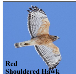
Red Shouldered Hawk

We are Your Experts on Bird Feeding. Got a question? Ask our certified bird feeding specialists.