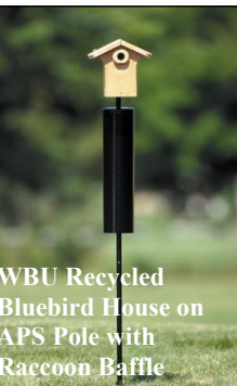
WBU Recycled Bluebird House on APS Pole with Raccoon Baffle

Bluebird lovers: now is the time, before the ground freezes, to replace or install a new bluebird house in preparation for Spring. We have a special pole system and baffle just for bluebird house mounting.