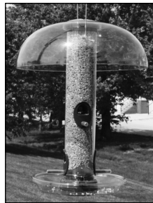
Quick Clean Feeder with Weather Guard and Tray

Clean your feeders with warm, soapy water and sanitize them with a 10% bleach solution. If you're looking to replace a feeder, try a Wild Birds Unlimited EcoClean Feeder.