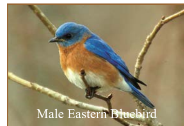
Male Eastern Bluebird