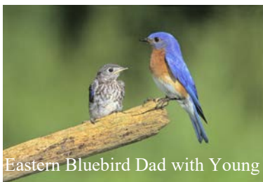
Eastern Bluebird Dad with Young