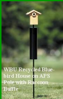
WBU Recycled Bluebird House on APS Pole with Raccoon Baffle