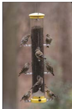
Quick-Clean Finch Feeder with Nyjer

Elevated feeding birds live in forests and forage for food in trees. These birds prefer sunflower seed, safflower, sunflower chips and peanuts. To attract these birds offer WBU Supreme, Choice, Nyjer or No-Mess Blends in a Quick-Clean Seed Tube or Finch Feeder or a hopper-style feeder on an Advanced Pole System bird feeding station.