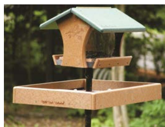
EcoTough Hopper Feeder with Choice Blend and EcoTough Tray with Peanuts and Black Oil Sunflower Seeds

To attract birds on several levels at one time offer WBU Choice or No-Mess in an EcoTough Classic hopper feeder. Placing an EcoTough Tray filled with Sunflower Seed and Peanuts beneath your feeder provides open spaces for mid-range birds to easily reach seed that is scattered from above.