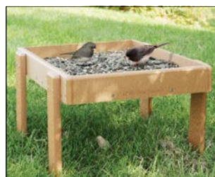
EcoTough Ground Tray with WBU Premium Blend

To attract ground feeding birds, offer WBU Select Plus Blend or No-Mess Blend in a ground feeder like our EcoTough Ground Tray.